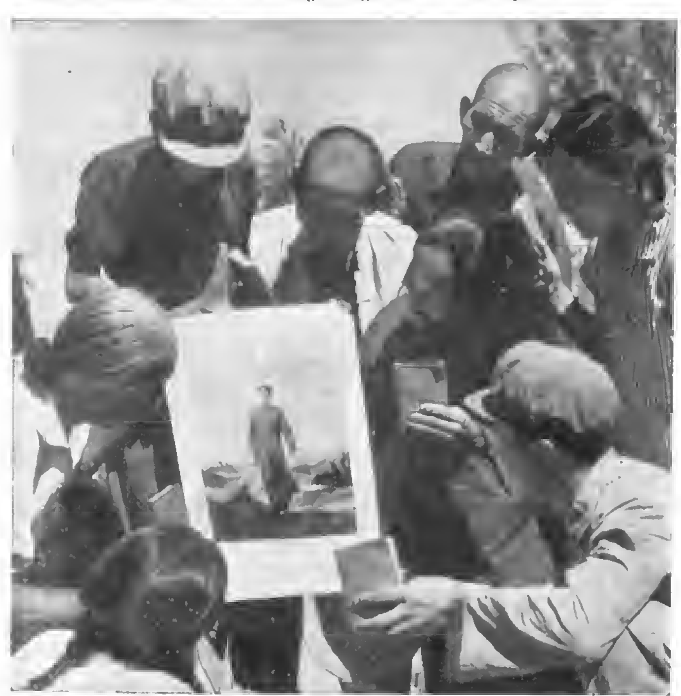
Commune members near Peking delighted with a reproduction.